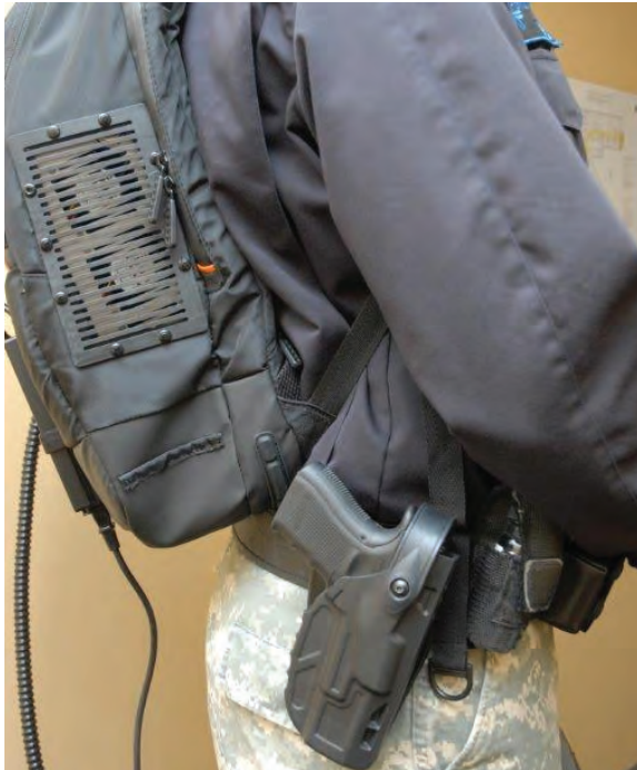
Unit shown in optional backpack

Incorporating decades of laser expertise, BrightBeam® ULTRA systems bring together the latest technologies to achieve “state of the art” performance and reliability. Every element of the system’s design, both internal and external, have been uniquely tailored and optimized for the forensic professional.